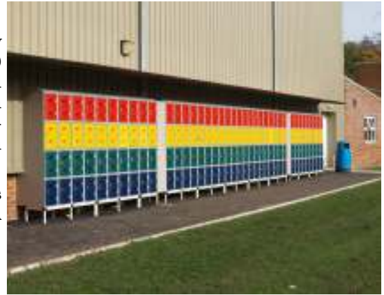
The new PE lockers outside the sports hall

At 6.12.10 there was £14,337 in the PA accounts.