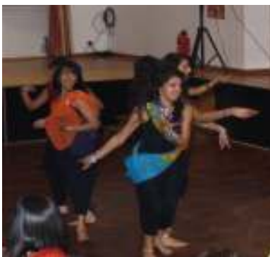
Girls from the Year 13 Bollywood dance team