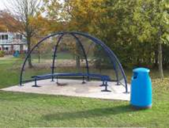
One of the new outdoor shelters

We mentioned outdoor seating areas and new PE lockers outside the sports hall in the last newsletter. These have now been installed—here are some pictures of these items in situ.