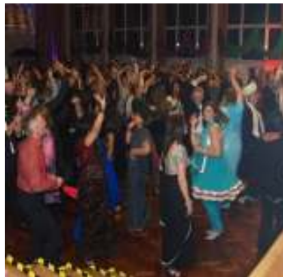
The dance floor was packed